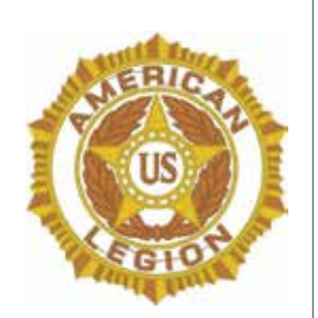
American Legion 1016