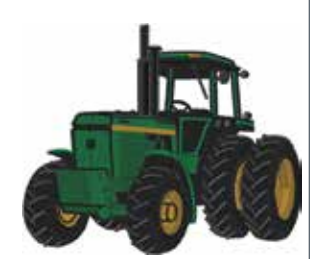
John Deere Tractor 1806