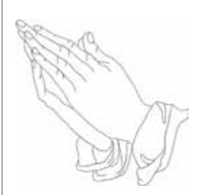
Praying Hands 1305