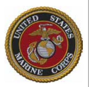
U.S. Marines Full Stitch 1744